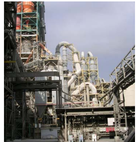
Nesher Cement Plant, Israel