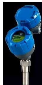
Eclipse Model 706

The Modbus Organization recently certified the Magnetrol Eclipse Model 706 , a smart level transmitter operating on the principle of Guided Wave Radar. The Model 706 can be used in many level measurement and control applications, including those containing visible vapors, or media with varying dielectric constant or specific gravity.