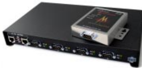
DeviceMaster UP Gateway

Control's DeviceMaster UP gateway also includes the patent-pending DualConnectPlus technology. This provides dual connectivity between your serial or Ethernet device and a PLC and/or application at the same time. The filtering and data extraction engine can filter a string, barcode, and RFID data and extract those UPC/EAN barcode and EPCglobal RFID tag parameters so you don't have to.