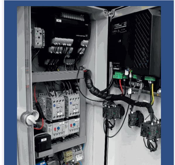
Sewage pump controller with a CIM 250 module and GSM/ GPRS modem are to the right.

Data is communicated wirelessly every 10 minutes to the central SCADA system. In an alarm situation, the SCADA system ensures correct alarm handling.