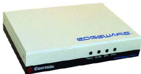
Control's EdgWare Controller

For more information, visit www.comtrol.com .