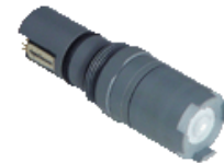
Sensor Head (Dissolved Oxygen Sensor)