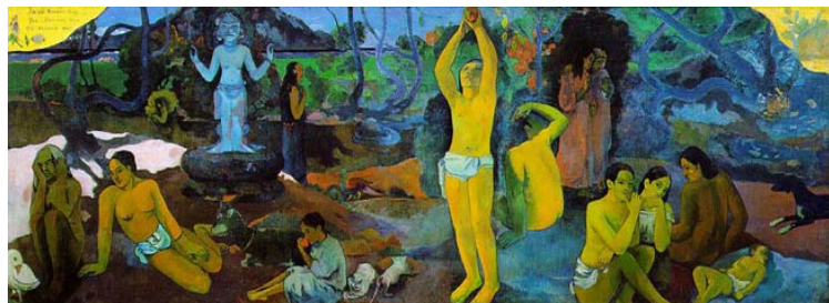
Where Do We Come From? What Are We? Where Are We Going? Paul Gauguin, 1897-98

If you happen to be at ISA EXPO 2006 October 17-19, stop by and wish us Happy Birthday!