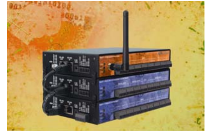
Anybus X Gateway

For more information, visit www.sealevel.com .