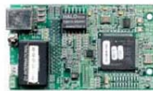
CM090 Modbus/TCP/IP Option Card

With the CM090, a maximum of 10 simultaneous connections are allowed. This implementation of MODBUS TCP/IP supports MODBUS functions 3 (read multiple registers), 6 (write single register) and 16 (write multiple registers). The Yaskawa website provides an excellent example of the product's use in a document titled, Using Yaskawa VFD's "Modbus TCP-Ethernet Option" with Allen Bradley CLX Programmable Controllers , which describes an implementation using Yaskawa's 5 and 7 series variable frequency drives with Modbus-IDA member company Prosoft Technology's MV156-MNET interface module.