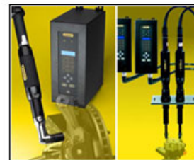
QPM Family of high performance assembly tools

The QPM Sigma Controller, Model Q3000 was tested for conformance to Modbus-IDA Conformance Test Policy Version 2.1.