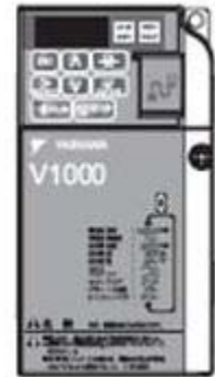
V1000 AC Drive

For more information, visit www.yaskawa.com .