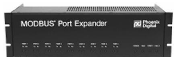
Modbus Port Expander