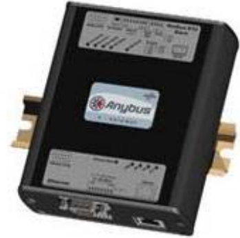
Anybus X Gateway

For more information, visit www.anybus.com .