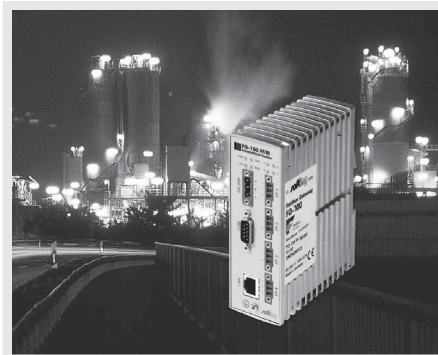
Fig. 1: Gateways between FF H1 and Modbus/TCP facilitate the migration to Foundation Fieldbus.

Foundation Fieldbus is a powerful process automation system which offers numerous advantages over conventional technologies in terms of production quality and serviceability. But migrating to Foundation Fieldbus often entails changing the entire existing control technology - all the way to the management level. The costs associated with this may make it difficult to take such a step. But appropriate network gateways can lower the barrier to entry and enable a gradual migration to the new technology. CHRISTIAN BRÄUTIGAM